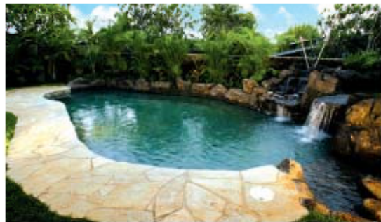
Lava rock "Grotto" pool with waterfall and spill-over spa.