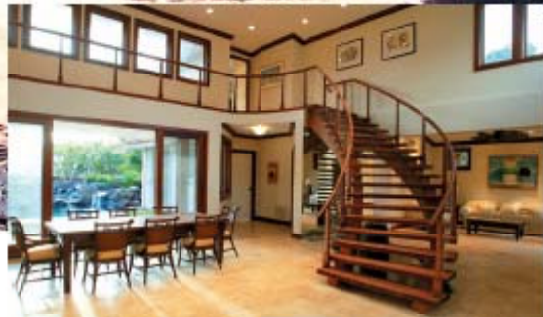
A hand crafted floating staircase made of South American Andiroba wood with Indonesian water vessel.